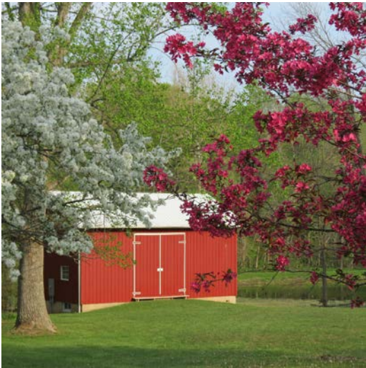
Mary Gray Bird Sanctuary in spring

Saturday, March 25, 9 am to 11 am: Henry County, IN, meet-up location to be announced