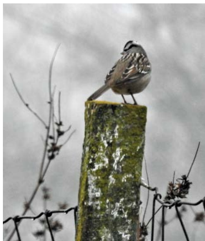
White-crowned Sparrow from this year's SANJO CBC

The population of Bald Eagles is increasing around the Limberlost Conservation Area. This year, twenty were recorded. In all, 52 species were tallied. Next year, the SANJO CBC will go back to its normal date of January 1, 2024. Thank you to all who participated.