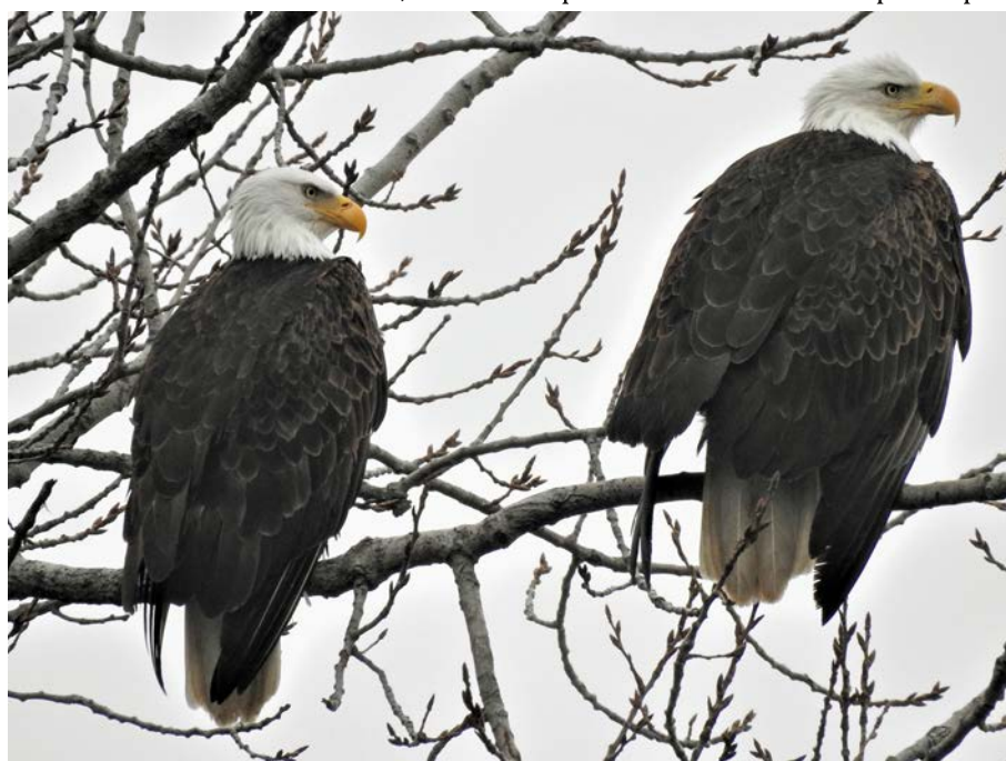
Pair of Bald Eagles seen on this year's SANJO CBC