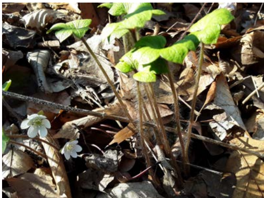
Spring comes to Indiana—Hepatica, Shooting Star, and Spice Bush in bloom at Mounds State Park in March of 2020