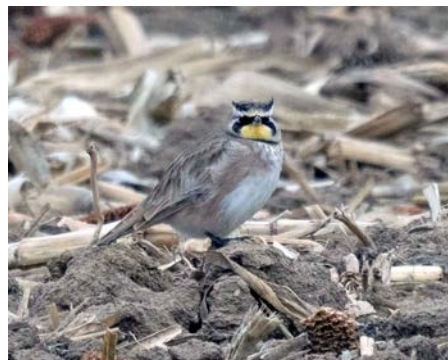
Face-off with a Horned Lark

Christmas Bird Counts are a great way to contribute to a citizen science effort that stretches back over 100 years while enjoying a fun day of winter birding. Keep them in mind come December!