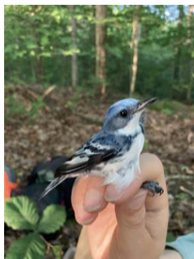
Cerulean Warbler

The meeting will start at 7 pm at the BSU Nature Lab at 2500 W. University Ave on the BSU Campus. Parking is available in front of the greenhouse, and is free after 5 pm. The building is handicap accessible.