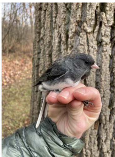
Dark-eyed Junco at a banding station