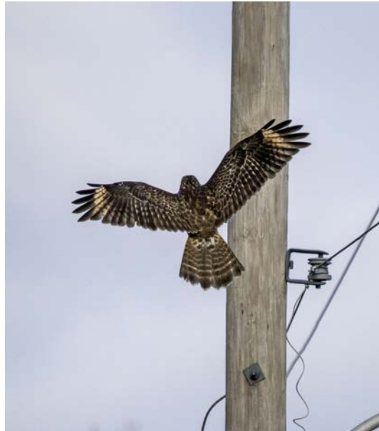
Mystery raptor, later determined to be an immature Red-shouldered Hawk

If you think you may like to participate in next year's count but the date is in conflict with your plans, remember that many other nearby Audubon Societies have counts that may be on different days. It is a good way to meet like-minded people, contribute to citizen science, and enjoy a day in the field. I hope to add your name in next year's compilation. Happy birding!