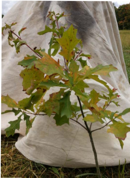
Chinquapin Oak