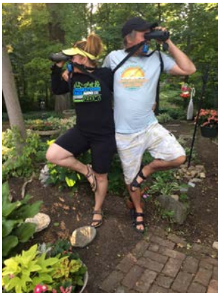
The Close Encounters Birdathon Team

Benefiting birds while having a ball raising money has been the goal of the Amos Butler Audubon Society (ABAS) since conducting its first Birdathon in 1987. The ABAS Birdathon has engendered more volunteer participation than any other chapter activity. Over 40 individuals take part in a "Big Day" event, scouring the state for a 24-hour period in a quest to count as many species as possible. You will be astounded by the record species count!